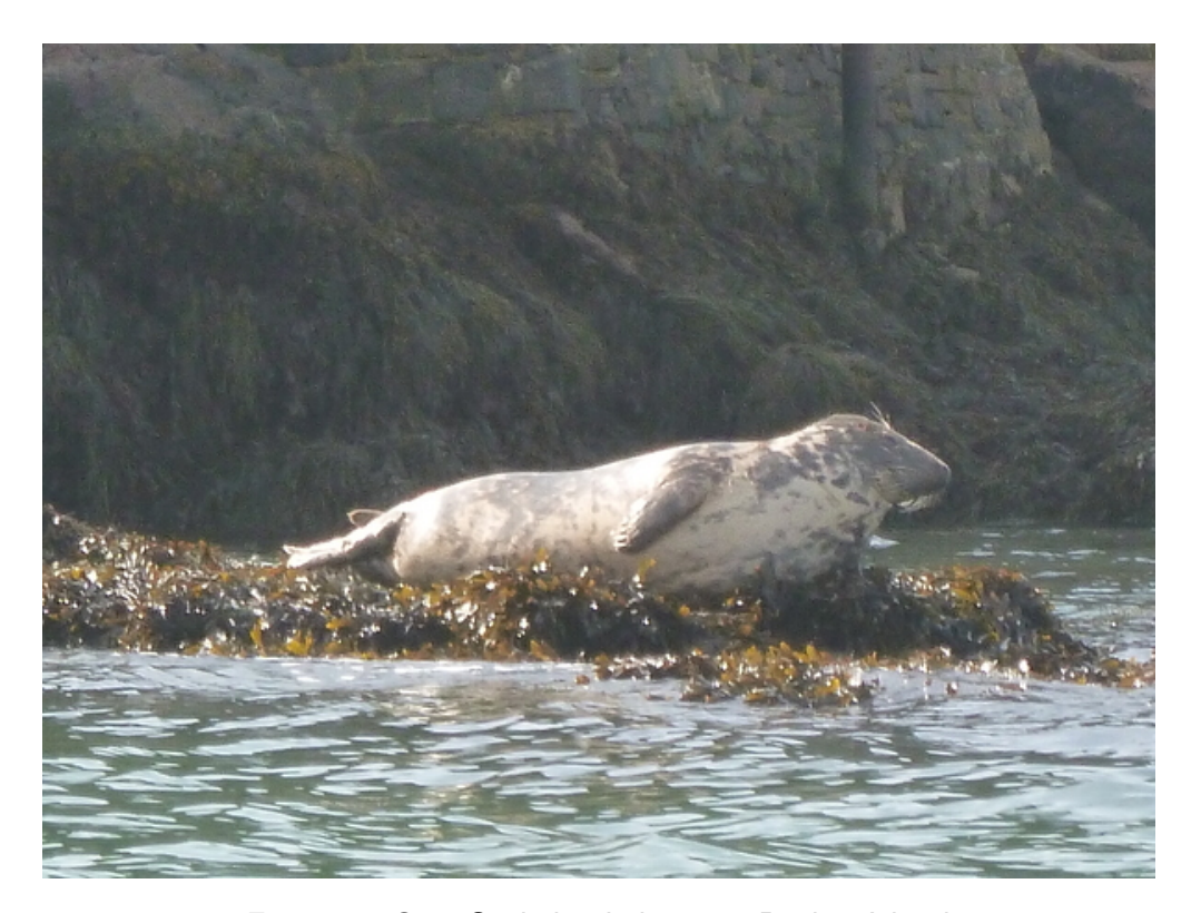
Figure 1: Grey Seals hauled out at Drakes Island

The Atlantic Grey Seal (Halichoerus grypus)