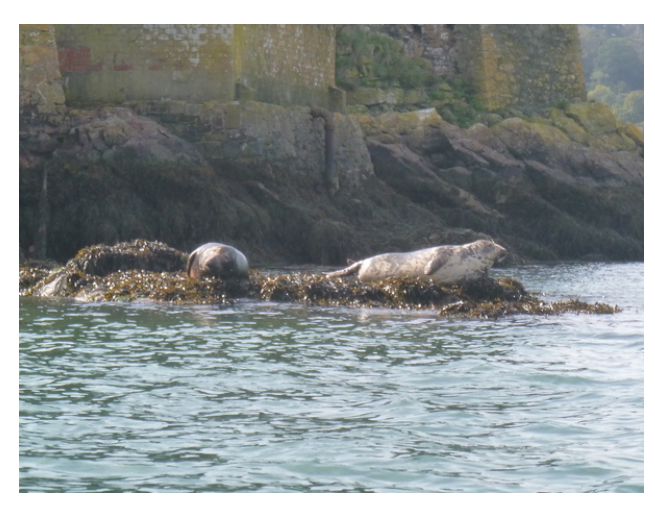
Figure 2: Grey Seals hauled out at Drakes Island

Although there are no large seal colonies in the Sound there are several lone seals spotted all year round. In recent years there has been a small group of seals at Drakes Island You are likely to see seals in the water almost anywhere in the Sound. They do haul out onto rocks usually around Drakes Island.