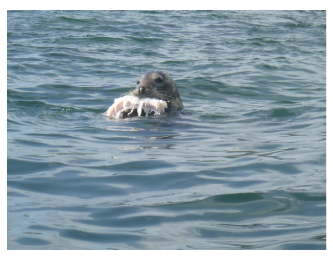
Figure 3: Grey Seal off Picklecombe

who likes to haul out near the breakwater lighthouse and is often seen in the water there.