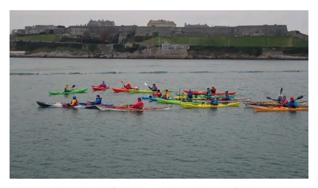
15th January Paddle