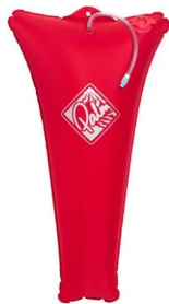
Figure 1: Arnold the Air Bag

Nobody volunteered a new member introduction this month. However, we are pleased to tell you of a new air bag that has been added to a boat that paddles with the PPCA fleet occasionally. Unlike a politician, who can only be full of hot air, this air bag does something useful in keeping water out of the boat when the owner capsizes. This makes it much easier for everybody else to empty the boat and remedy the situation.