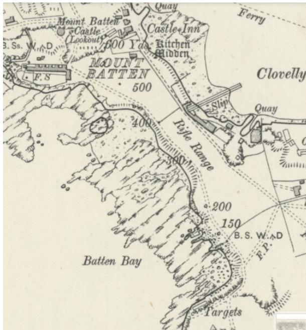
Map from the late 1800s showing the targets and yard markers

the Plymouth and Devon areas. The Mount Batten range was built for use for the Royal Marines who also allowed the local Plymouth detachment of the 2nd Devon Volunteer Rifles to use the range. The range was in constant use not just for mandatory class firings but many rifle competitions took place over the years.