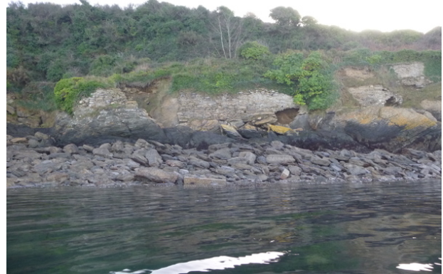
Remains of the target butts today

being allowed on the beach at Batten Bay and on footpaths to Stadden Heights. Not ideal but the range continued in use until Mount Batten was converted to an RAF station.