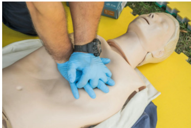
Figure 1:

I'm planning on organising a first aid course if there are sufficient people needing to take one. If you are interested, please contact the Club Welfare Office, Alan Ede on welfare@ppca-canoe-club.org.uk