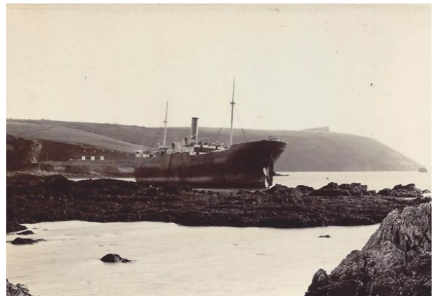
This old photo shows the rifle range targets to the left of the ship!

If you ever paddle over to the area there is a small beach to land on at LW. If you look amongst the rocks up towards the concrete and stone wall you will find the remains of old squashed bullets and occasionally whole ones.