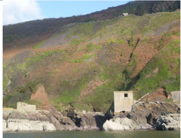
Figure 2: The mine observation station is above at the front of the quarry (to the right of the small building). The D.E.Ls are at sea level