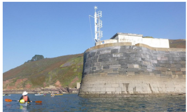
Figure 4: Remains of a D.E.L at the end of the Pier

The defensive mining of British harbours was stopped in 1905 under the orders of The First Sea Lord Admiral Fisher. The Submarine Miners and their establishments were disbanded.