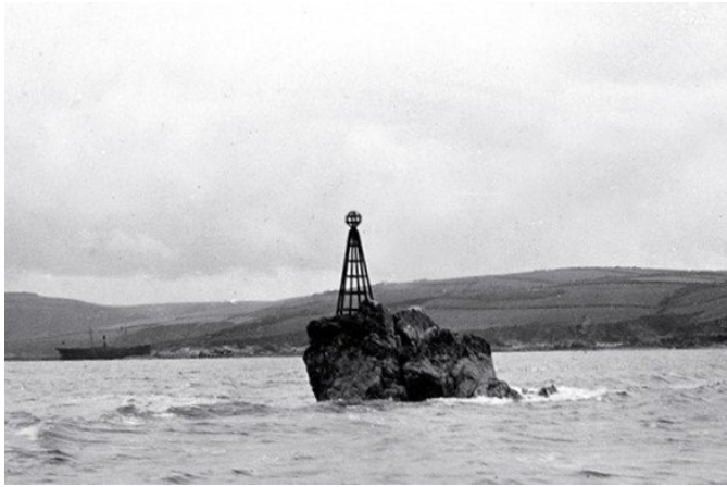
An early beacon on the Shag Stone 1912. In the distance the steam collier Vectis is aground and later wrecked

Most notable of the shipwrecks was in 1890 when the Steamship Nepal, at 375 feet long and 3536 tons ran aground near the Shag Stone while on a voyage from Calcutta to London. Also lost on the same night was the trawler Baroda. Another ship to meet an end on the reef a few years earlier in 1888 was the steam cargo ship the Constance. Tragically three of the crew lost their lives.