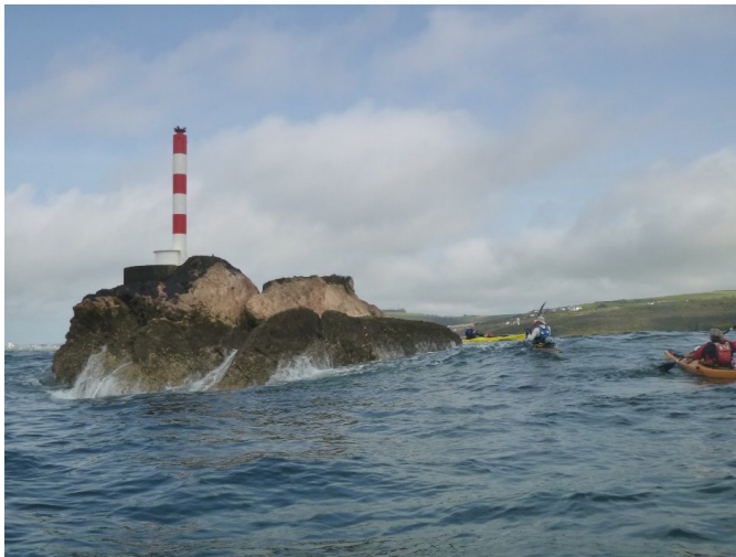
The Shag Stone With a Big Swell Running

The Shag Stone marks the eastern limit of the Port of Plymouth with Penlee Point forming the western limit.