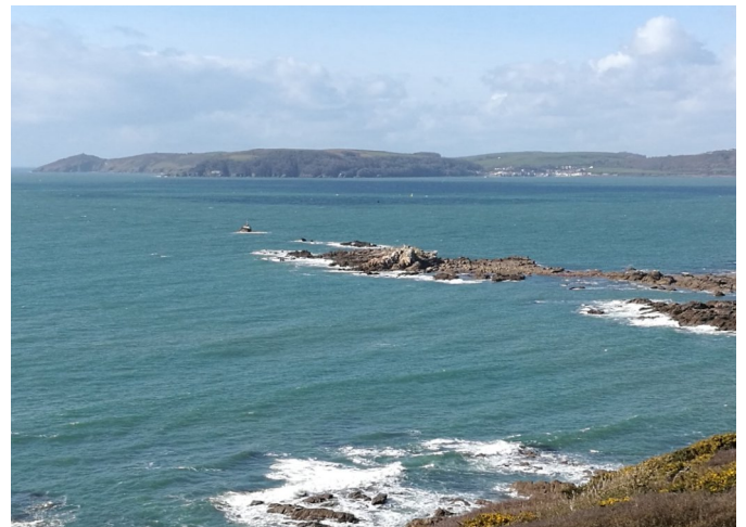
The Renney Rocks With The Shag Stone in the Distance

It is presumed that the rocky outcrop gets its name from the proliferation of Shags which use it as a convenient platform for resting. It is named on maps from the early 1800s and possibly earlier.