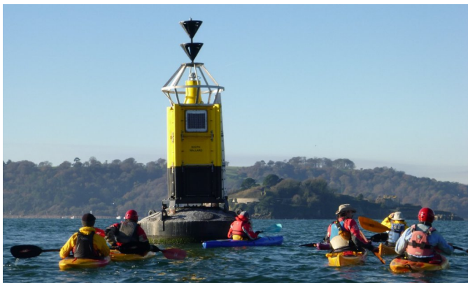
South Mallard Cardinal Buoy

Two buoys which will be familiar to most regular rec paddlers are South Mallard and South Winter Cardinal buoys. We often use these as our way points when crossing from the end of Mount Batten Pier over to Drakes Island or heading over to The Bridge and beyond.