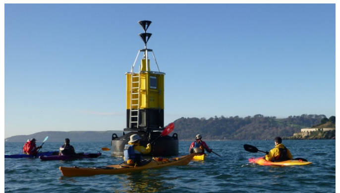
South Winter Cardinal Buoy

Cardinal buoys get their name from the cardinal points of a compass. They are used to warn mariners of a danger area and mark where safe water is. A south cardinal buoy will be south of the danger area and safe water will be south of the buoy. They also have a yellow and black colour scheme and flashing lights which differ for the various cardinals. This snippet will only have time to cover a few basic details.