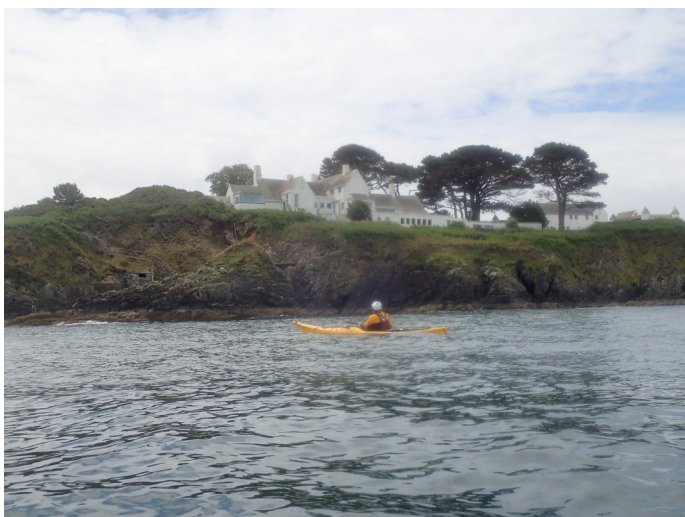
Chapel Point.

The summer of 2021 hasn't been one of glorious wall to wall sunshine. I have worn shorts but my knees have constantly shown a blueish hue, and my waterproof has hardly been out of reach. As a result, the landscape is looking very fresh and green. As well as being a shade of green that you would normally associate with Ireland the scenery made the journey worthwhile. We paddled around Black Head that boasted its usual rugged beauty while the campsite behind Pentewan Sands acted as a reminder of why we avoid beach holidays. Onto the cliffs around Penare Head that provided some gentle rock hopping after which we paddled past Mevagissey, around the low Chapel Point and onto Colona Beach for a well-earned lunch stop. All the while the cloud had been burning off and lunch was consumed in sunshine. The forecasters had got it wrong and I for one was very pleased that they had.