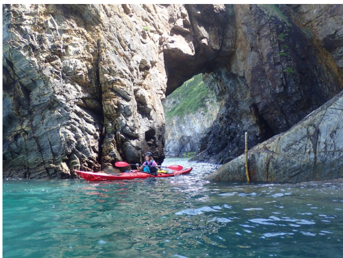
Rock arch near Porthpean.

Like the summer, wildlife sightings have been somewhat disappointing in 2021 but we did manage to see a seal just outside Mevagissey Harbour on our return journey and then, on a beach near Drennick, we saw some sunbathers who apparently couldn't afford to buy any bathing costumes. There are no photos.