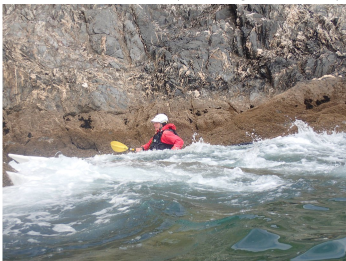
Rock-hopping near Penare Head.

I'm told that meticulous planning with a high degree of attention to detail is the key to running a successful trip hence, had you cared to look, on Wednesday 16 June you would have found me pondering the weather forecast. Unfortunately, the forecast didn't fill me with glee. They were predicting a deluge overnight on Saturday followed by rain during the day on Sunday. They were also forecasting force 3 SSW wind. And there was I was hoping for a gentle paddle under azure blue skies desperately trying to avoid overheating and sun burn. Fat chance. I decided that paddling from Porthpean would give us at least some shelter from the worst of the wind so that is what I put on the forum, together with the less than cunning plan that we would paddle around the coast until lunchtime, have lunch and then return. As previously mentioned, meticulous planning with a high degree of attention to detail is the key to running a successful trip.