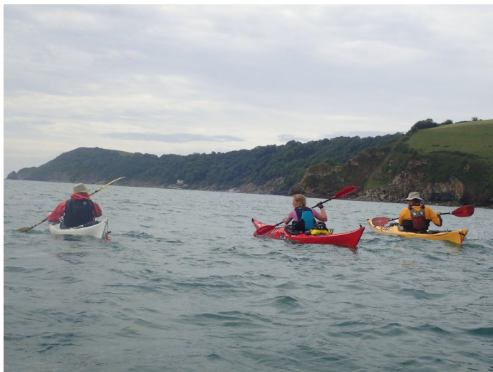
Paddling Towards Black Head.