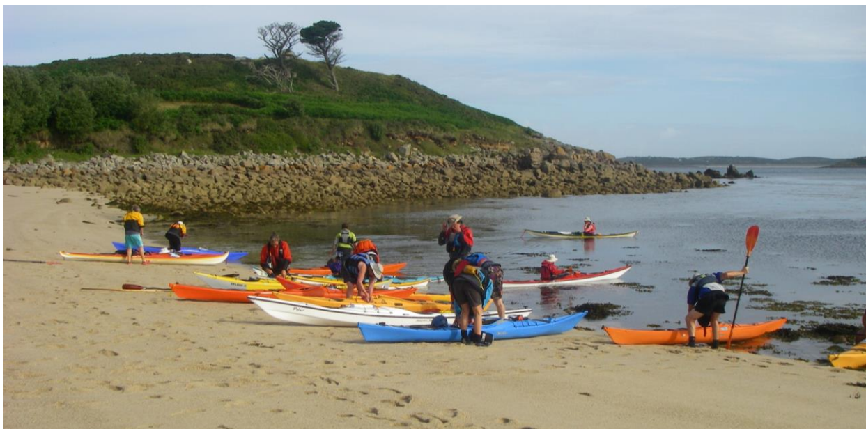
Pelistry beach (5 minutes from the campsite)

The application form for next year's Scilly camp is attached with this month's newsletter.