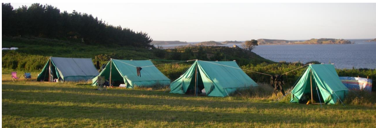
The campsite (just a few of the tents) what a fantastic view

I have been on a number of these camps and they are fantastic. If you enjoy sea kayaking and want to paddle in one of the best sea kayaking destinations in the world then now is your chance. Fill out the application form and send it to Joy.