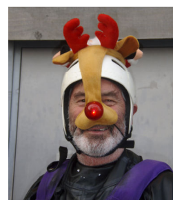
There was none of this in 2013.

More importantly I also haven't commented on the fact that the PPCA family is made up of lovely people who are a pleasure to be with. Thank you all for your company.