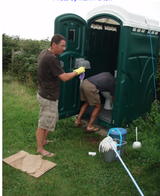
All the president's men.

That's all folk; see you somewhere cold and wet. Good paddling, Clive.