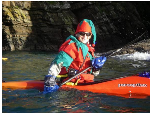
A club Xmas paddle from a few years ago