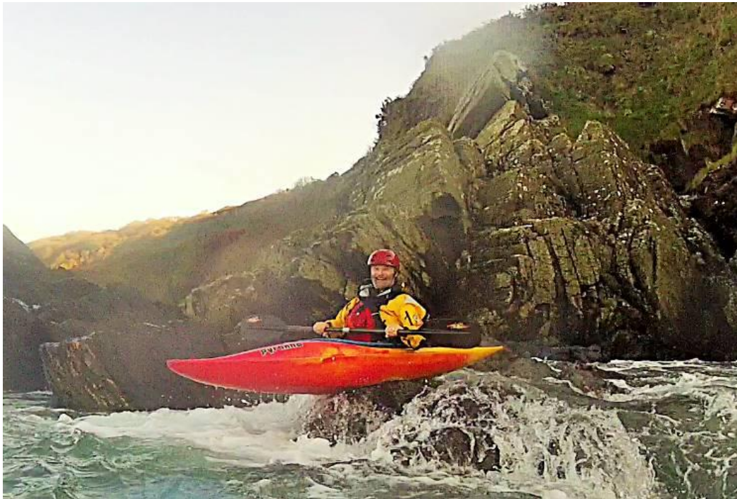
High, dry and smiling