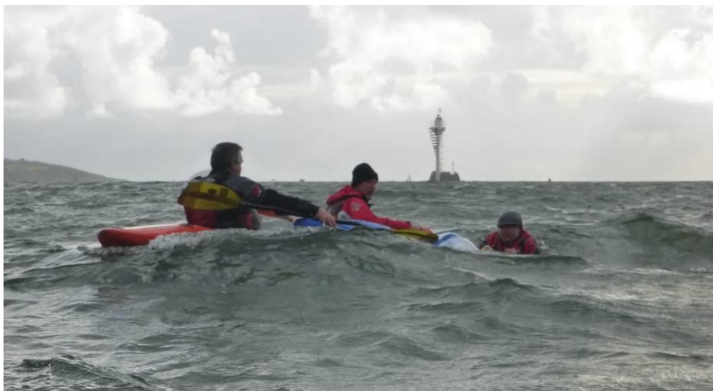
A recent Saturday paddle and the squid makes a surprise visit