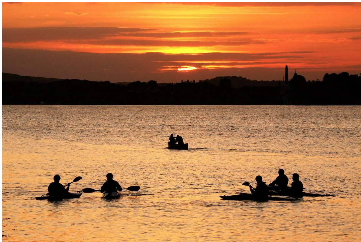
Photo from one of the PPCA photo competitions (supplied by Mary McArdle)