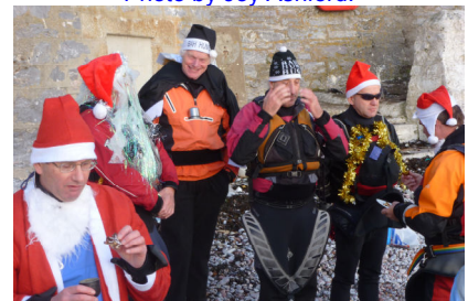
Santa's, Humbugs and the Mafia join the 2011 Christmas paddle.