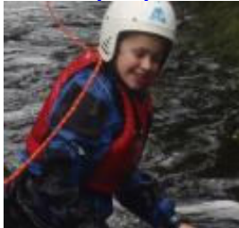
The PPCA makes the young ones smile as well.

Then on Sunday 20 October 20 paddlers took part in the club beginners' river trip on the Lower Dart. River running logistics necessitate there being a group of vehicles at each end of the trip, the ones at the lower end being used to store snugly warm dry clothing so that our intrepid white water warriors can quickly get warm and dry at the end of a trip.