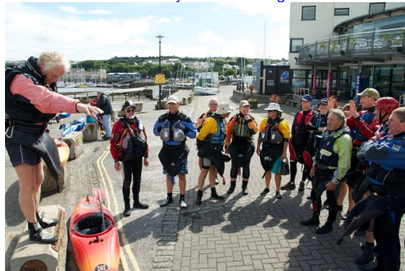
Elephant in the room!

That's all folk; see you somewhere cold and wet. Good paddling, Clive.