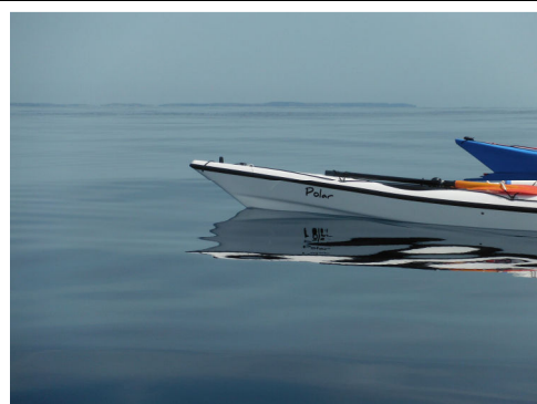
Second prize. Polar reflections.