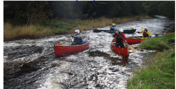
(Soon to be) Expert open boaters.

I will save your brain cells by doing the sums for you. In total the club had 45 paddlers taking part in a diverse range of club activities over the weekend. That's 45 people outdoors, grinning widely in weather conditions that may have had "normal" people hiding in front of the telly. I picked this particular weekend