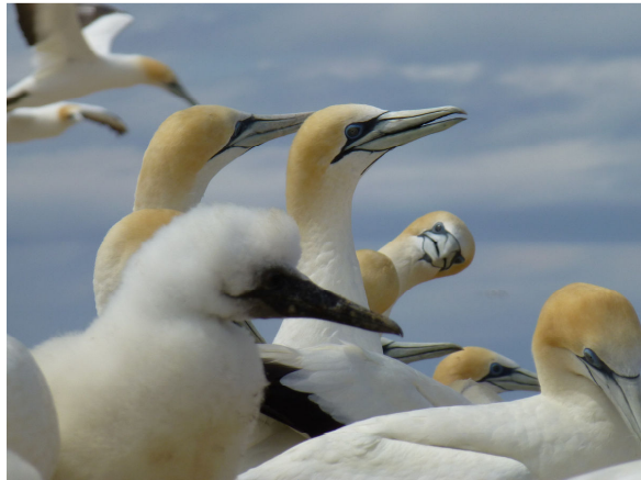
1 st prize. I can see you.