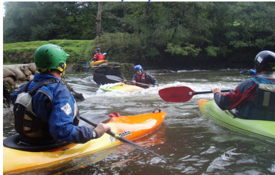
Playing on the Tamar.

because I happen to know exactly how many people paddled on each trip, but if you look at our diary dates for the next few months you will find that this weekend was nothing exceptional. Activities on offer include: recreational paddles, introductory recreational paddles, sea kayak paddles, introductory sea kayak paddles, beginners river trips, intermediate river trips and open boat river trips. Oh, and then there's our eagerly anticipated Christmas paddle on 21 December, details of which will appear in due course. That's quite a lot of paddling available to you, our members, to keep those winter blues away. There's no excuse to be miserable so wrap up warm, keep paddling and let those smiles grow.