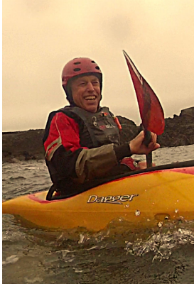
The PPCA makes an old man smile.

15 intrepid paddlers took to Plymouth Sound for a blustery Saturday paddle on 19 October. We were treated to choppy and sometimes interesting conditions but the paddle was deemed to have been a success, so good in fact that all 15 of us retired to the Mount Batten bar afterwards for a bit of social discourse. (I ran this trip and claim that the crowded bar was down to my natural charisma and magnetic personality, I'm sure that you all concur with this opinion).