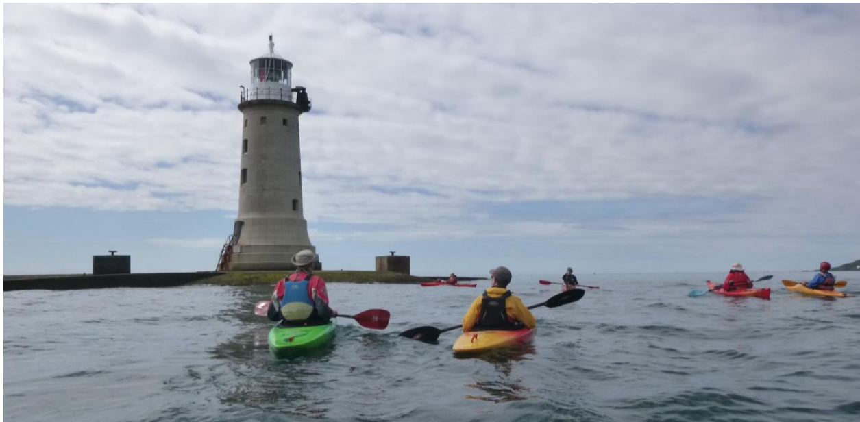
Rec paddle off the Breakwater Lighthouse

I have run a fair few of the club recreational paddles and enjoy the company and social side as much as getting out on the water, be it locally in Plymouth Sound or somewhere else in the local environ. In the olden days (a year or two ago) it was the norm to have lots of new paddlers joining in and experiencing the joy of recreational paddling. What has become apparent is that we are not getting the numbers of new paddlers like we used to. I'm not sure why, there appear to be lots of new faces coming on a Tuesday evening. I know it is still early in the club training year and the 1 star courses are just getting started. But please spread the word about coming out on a Saturday and the enjoyment that a leisurely paddle brings. They are suitable for all abilities and will be matched to those who are paddling. So if you are new please come along and give it a go. See the club forum for details of the days paddle or give the nominated coach a ring if you want to find out more