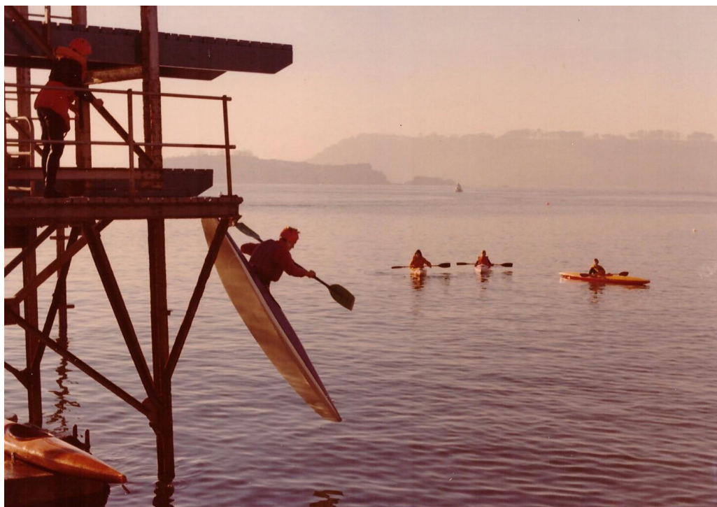
Hoe diving boards 1976