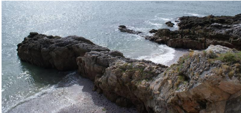
Round of Beef from above

One of my pet subjects is local history and I am always trying to find out where some of the strange place names in our paddling locality come from. Ordnance survey maps from the late 1880s show a rock formation called the 'Round of Beef' (see photos), it is located at West Hoe. My thoughts are that it comes from the shape of the rock and resembles a cut of beef with that name. I will leave it up to you if you agree with my conclusion. Any other suggestions please let me know.