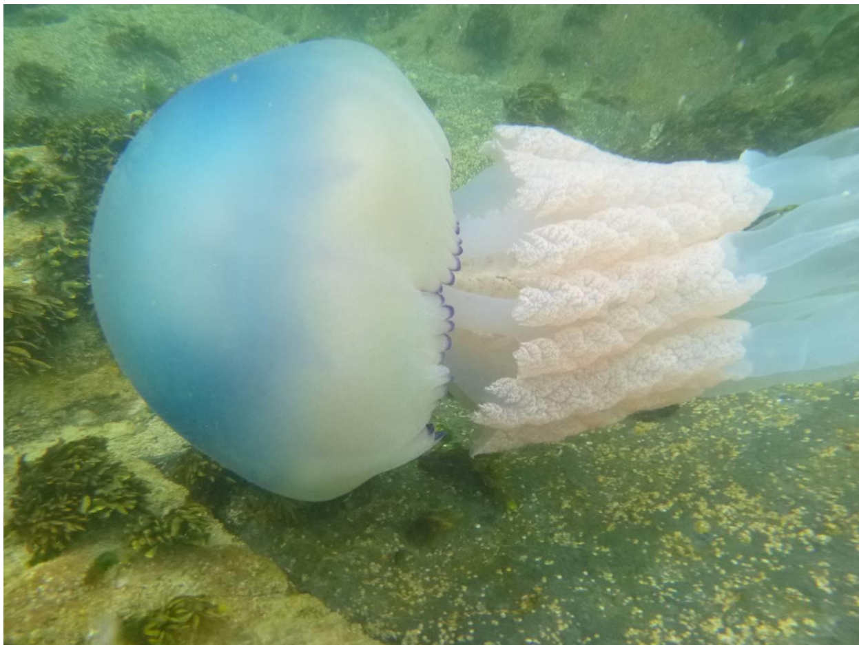
Barrel Jellyfish taken during a club rec paddle