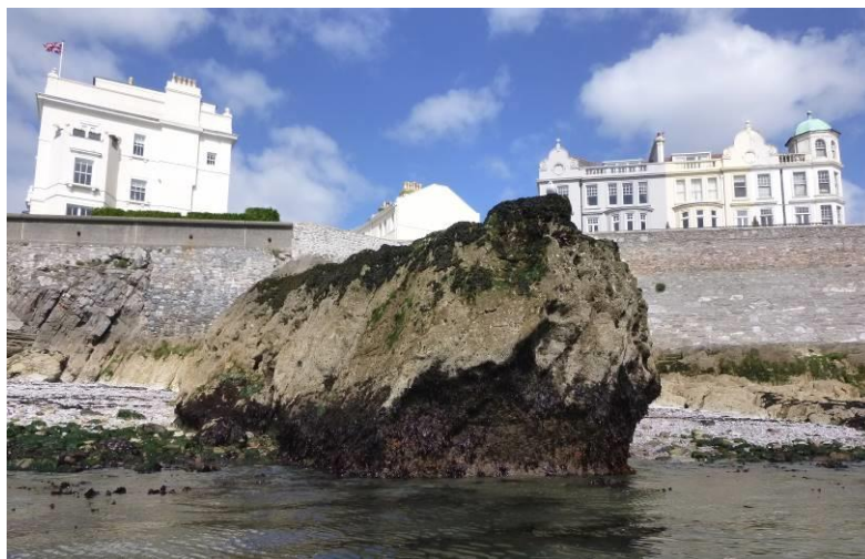
From kayak level

The round is a kind term for the rear end of the carcass.