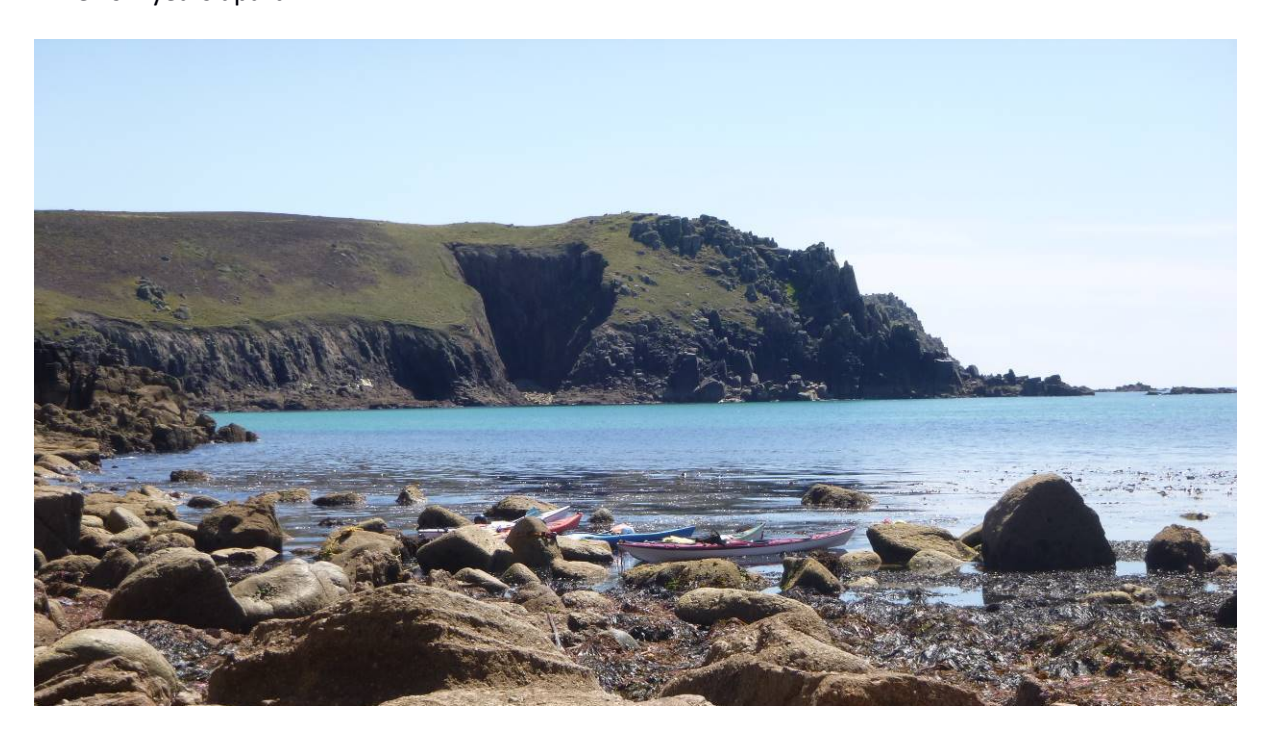
Nanjizal Bay (Lands End) 2015 (above) 2017 (below)