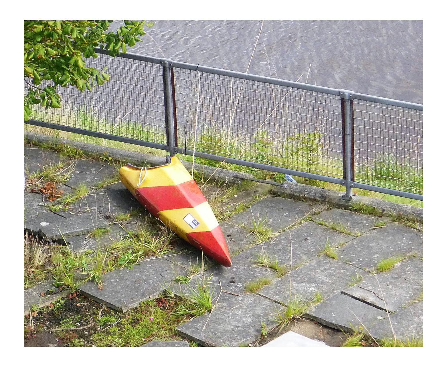
Every picture has a story. Wonder what this one is?<sup>2</sup>