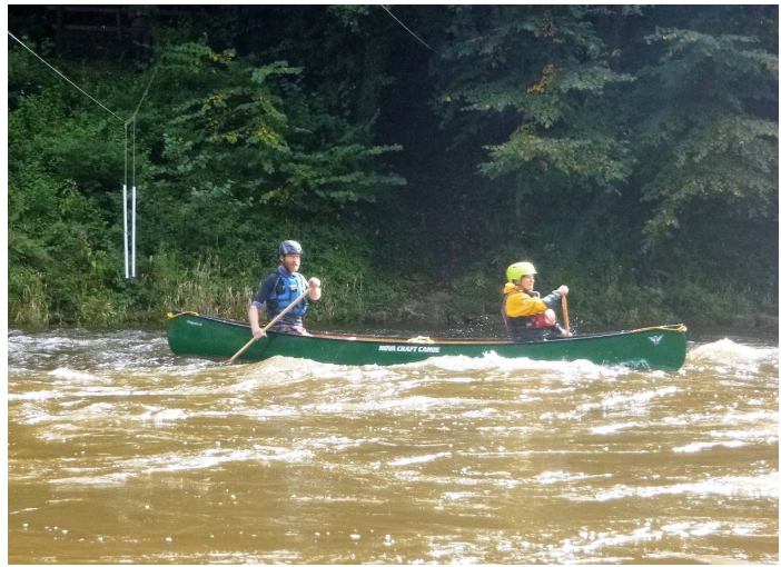
Bottom of the Rapids

the river was just delightful, it was not too fast but made relatively easy paddling. My initial worries about there being too much water were unfounded. Before long the river takes a massive turn north as the limestone gorge becomes apparent with towing cliffs overhead. The river continues on until it makes another turn to the south and we made our way into Symonds Yat. I was expecting to see plenty of other water users and ferries plying their trade, but it was very quiet which suited us. Nearing the top of the rapids we pulled in for a chat before descending. I would lead the way down and once in an eddy at the bottom the others would follow. The apparent best line down started over to the right of the main flow and gradually pulled us over to a large standing wave but a flurry of draw strokes pulled us back on line and onto